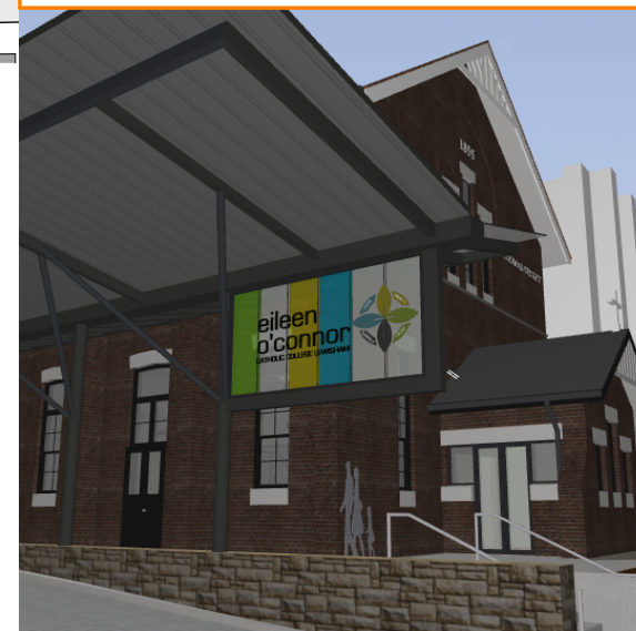
BLOCK B SIGNAGE AWNING MOUNTED IDENTIFICATION SIGNAGE.