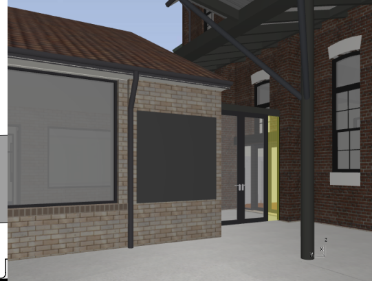
BLOCK C SIGNAGE FACADE MOUNTED WAYFINDING SIGNAGE